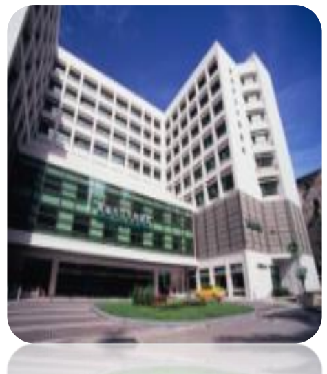
保障實習就業機會 Opportunties of intership & carrer in 4 reputable hospitals