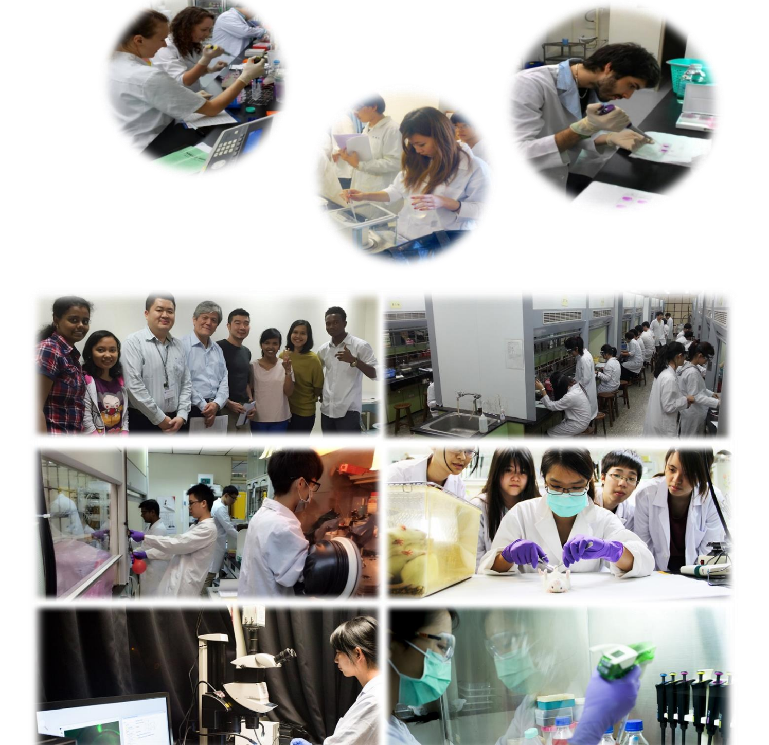
豐富學習資源 Abundance of Educational Resources